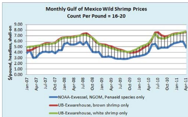
Fig. 2. Monthly ex-vessel and ex-warehouse prices ($/lb), GOM wild Penaeid species only, 16-20, Jan. 2007-Apr. 2011. Sources of data: NOAA Fisheries and UB Comtell.

2007-2011. Sources: NOAA Fisheries and UB Comtell.